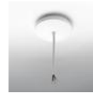
SURF SOSPENS. ALIM.5 POLI BCO M091820