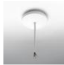
SURF BASETTA SOSP.ALIM.BCO M090720