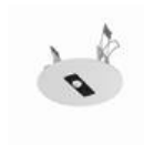
INTERACTIVE-DALI kit Ø86mm, white, recessed. Can be connected to a max. 11 DALI dimmable units. Is operated through INTERACTIVE-DALI remote control or external push button. M074030