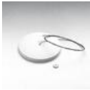
SURF BASETTA SOSP.BCO M090620