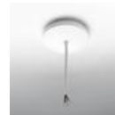
SURF SOSPENS. ALIM.5 POLI BCO M091820