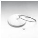
SURF BASETTA SOSP.BCO M090620