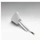
SURF ATTACCO A PTE ALIM.BCO M090920