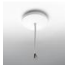
SURF BASETTA SOSP.ALIM.BCO M090720