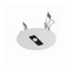
INTERACTIVE-DALI kit Ø86mm, white, recessed. Can be connected to a max. 11 DALI dimmable units. Is operated through INTERACTIVE-DALI remote control or external push button. M074030