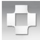
SURF ELEMENT DE JONCTION + BLC M090520