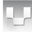
SURF ELEMENT DE JONCTION T BLC M090420