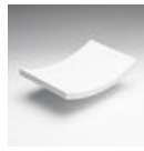
SURF TERMINALE BCO M090220