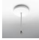
SURF BASETTA SOSP.ALIM.BCO M090720