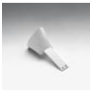
SURF ATTACCO A PARETE BCO M090820