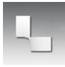
SURF GIUNTO 90° BCO M090320