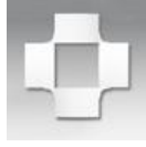
SURF ELEMENT DE JONCTION + BLC M090520