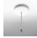
SURF SOSPENS. ALIM.5 POLI BCO M091820