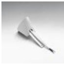
SURF ATTACCO A PTE ALIM.BCO M090920