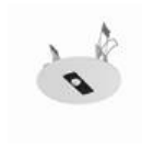
INTERACTIVE-DALI kit Ø86mm, white, recessed. Can be connected to a max. 11 DALI dimnable units. Is operated through INTERACTIVE-DALI remote control or external push button. M074030