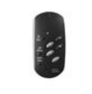
INTERACTIVE-DALI remote control. M104900