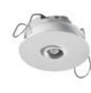
Extension movement detector white, recessed. To be used when the area to be covered is bigger than 6,00x5,00m by height 2,50m. To be connected to one of the outputs of the INTERACTIVE-DALI controller. No extra mains connection required. M074130