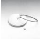
SURF BASETTA SOSP.BCO M090620