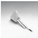
SURF ATTACCO A PTE ALIM.BCO M090920