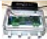
DRIVER LED NLX 2-100 RGB 100W IP65 NL84100