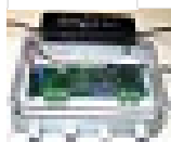
DRIVER LED NLX 2-70 IP65