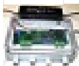
DRIVER LED NLX 2-70 IP65